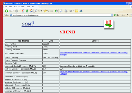
Above: Internet Source sheet for the Shenzi Discovery, which displays the website links to the article, publication or presentation used to gather the data.

New Prospects – We research the same sources of information as discoveries for the latest prospects announced in the Gulf of Mexico. Each week New Prospects are added to GOM 3 -ArcView and GOM 3 Online. Hotlink on a New Prospect to get the Prospect Report or select the Internet Sources option to view the source sheet.